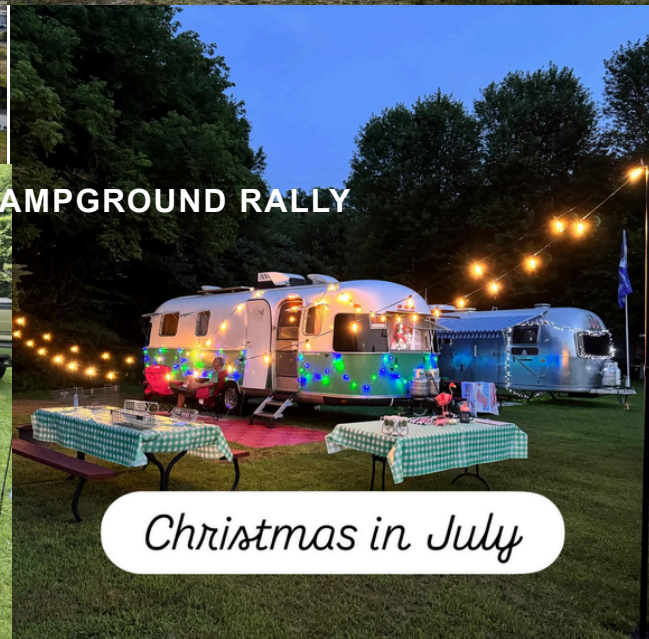
Christmas in July