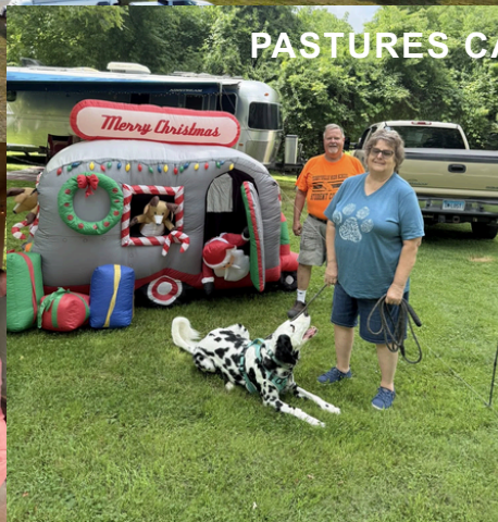
PASTURES CAMPGROUND RALLY