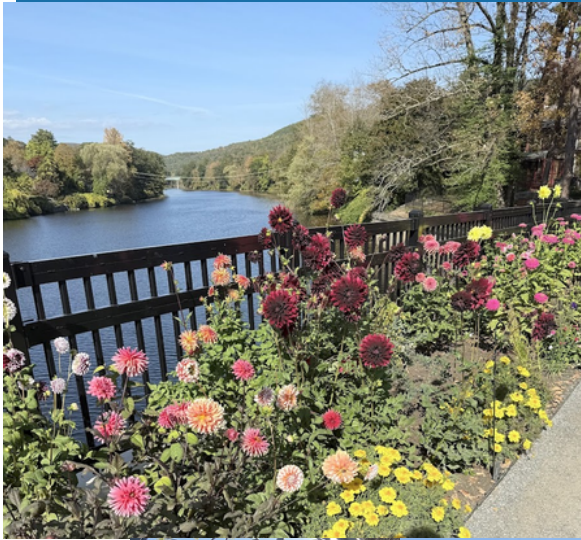
CT SWEATER RALLY IN BERNARDSTON, MA