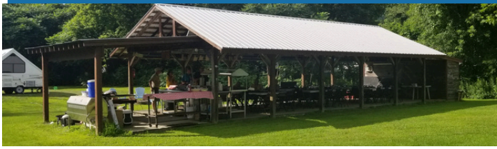
Pastures Campground Rally