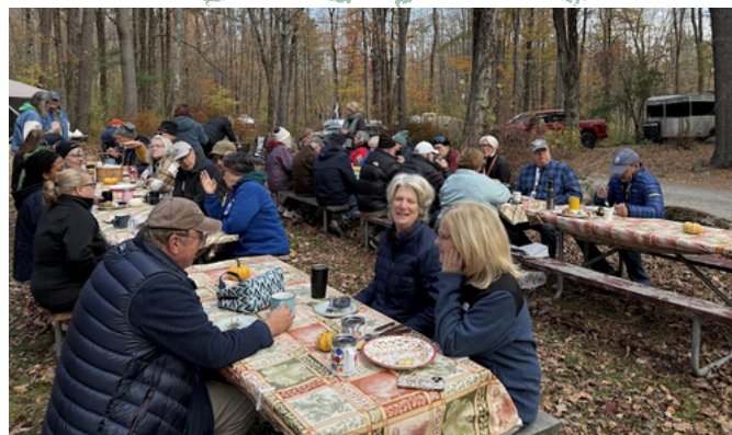
MT GREYLOCK FALL RALLY